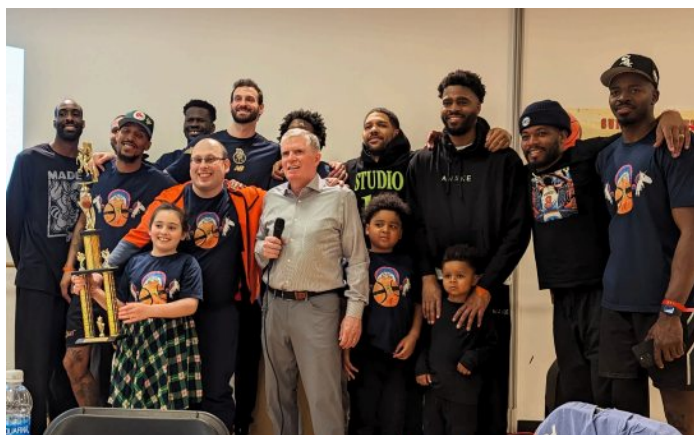
[Max's All Stars - Open Division Champions]

What a truly inspiring day for all who attended!