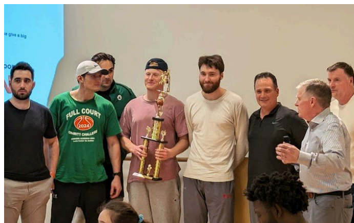
[Brickhouse - Corporate Division Champions]