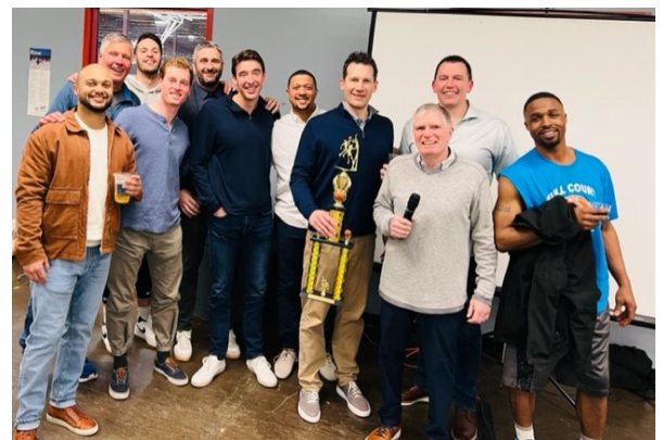
Donohue's - Open Division Champions