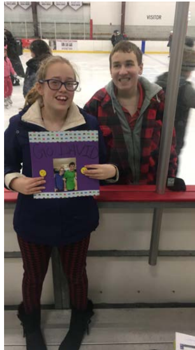
NLG students enjoyed ice skating during the winter months at Edge Sports Center in Bedford!