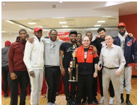
Max's All Stars Corporate Division Champs!