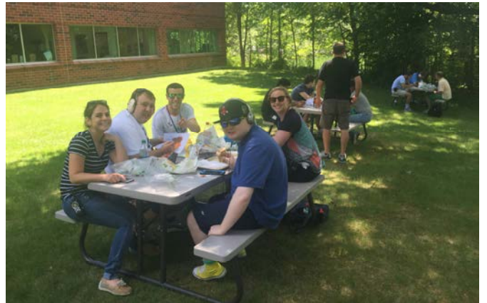
Current outdoor space at 170. Members and staff are excited for the changes!