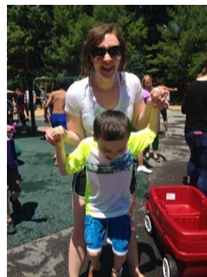
Students and staff enjoyed cooling off with a water balloon fight!