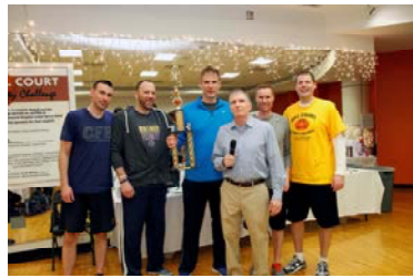
Instinet Corporate Division Champs!