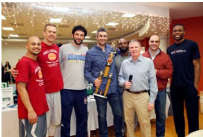
HighFields Open Division Champs!