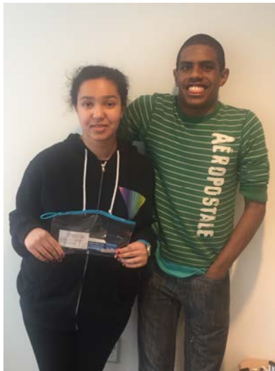
Two vocational students packaging dental home care bags for Melrose Family Dentistry.