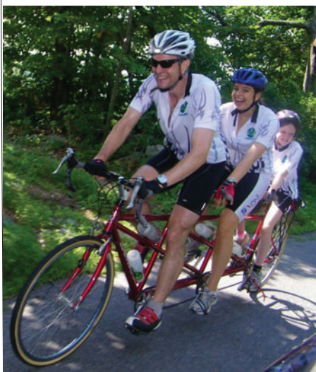
The Collings Foundation